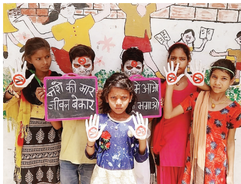
Children from Rasta NGO showcase their standpoint against tobacco and drug abuse