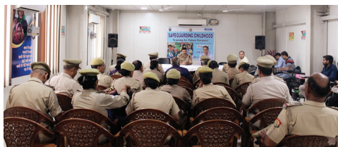
Police Training conducted by CHETNA NGO in Lucknow creating a platform for discussion on child issues and their resolution