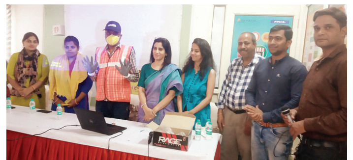
'Training of Rag-pickers'