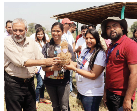
HCL Team along with partner NGOs at Sorkha Plantation Drive