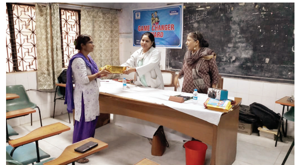
'Game Changers Awards'

Vatsalya organised felicitation ceremony of game changers from the community at CHC