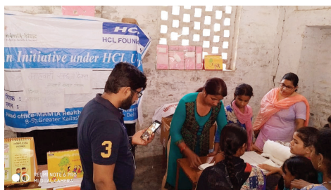
HCL Volunteers making low cost sanitary napkins during an initiative made by the team of MAMTA NGO