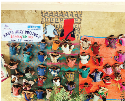
Rasta Uday Project celebrates International Yoga Day